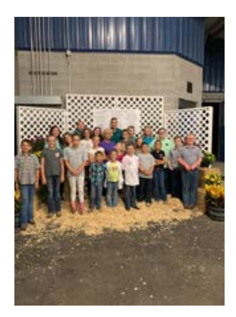
SCOTT COUNTY EXHIBITORS