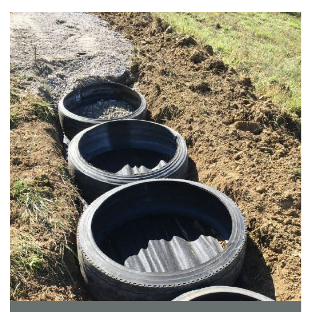
Nonwoven geotextile fabric and tread cylinders are placed in a trench and backfilled with dense grade aggregate (DGA).

An actual tire cylinder may be approximately 40 inches in diameter, but the removal of the tire sidewall will enable the tire cylinder to fit within a 36-inch-wide trench. Nonwoven geotextile fabric should be placed in the bottom of the trench. This material is needed to provide the drainage, reinforcement, friction, and separation necessary for structural integrity. The tread cylinders are then placed end to end, on top of the geotextile fabric. A suitable rock material, such as dense-grade aggregate (DGA), is then placed inside and around the tire voids. The top edge of the tire cylinder should be at grade level or a little higher.