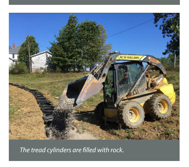
The effort required to install an all-weather surface trail for grazing animals will not be wasted. Grazing animals and their offspring can be seen using these trails during all times of the year. These trails provide energy efficiencies for animals, particularly during wet weather periods.

Grazing animals will create efficient routes to acquire water, mineral, or feed. However, these trails may become difficult to travel during periods of wet weather. Erosion of the trail could also expose clay subsoil, which can