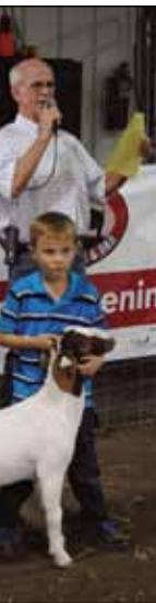
- Fayette County