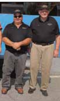
n County erprise, for taking and