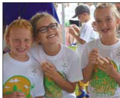
A group of girls enjoy the ice cream sample that was given to them after learning how to milk a cow.