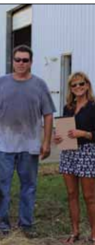
g from Georgetown ison County Beef Cattle tor's admission fees.