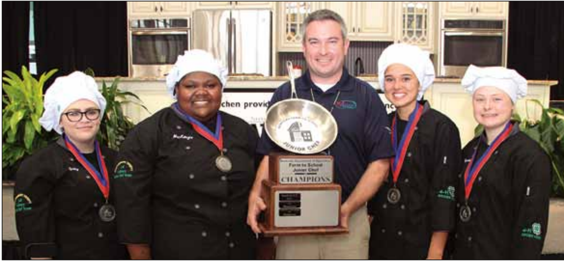
Champion Junior Chef Team at the KY State Fair (see names below)