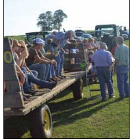
Four wagons were fully loaded for the Horn farm tour.